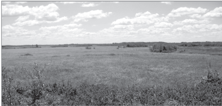
"THE 'EXPANSE' OF CREX MEADOWS"

Crex Meadows is located just north of Grantsburg, Wisconsin, about 1.5 hours from the Twin Cities. Crex Meadows is a beautiful 30,000-acre wildlife area containing wetlands, forests and